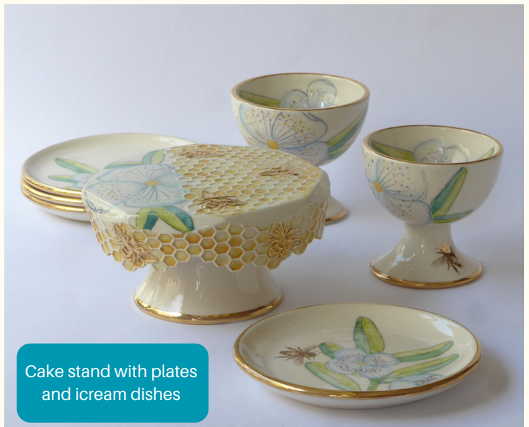
Cake stand with plates and iced cream dishes